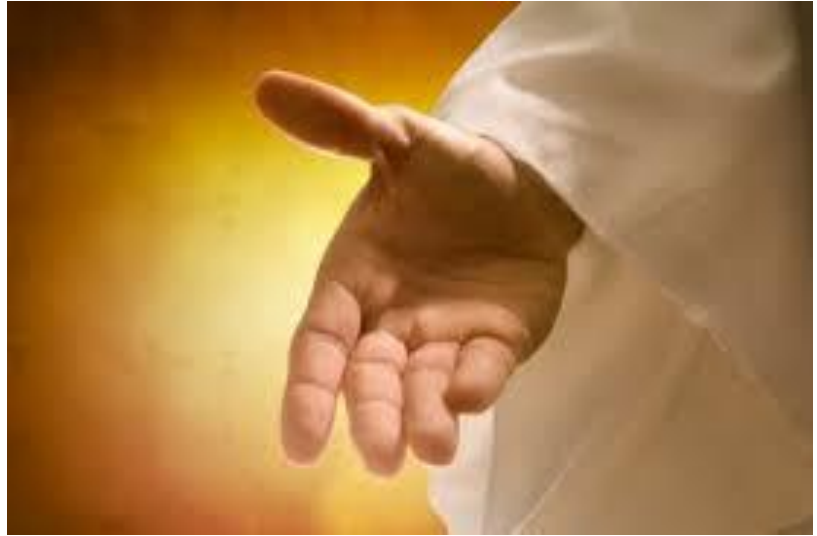
The offer of healing

Our ideal is a church of the open mind, the warm heart, the hopeful spirit, and the social vision which ever seeks to express, in all walks of life, the mind of Jesus.